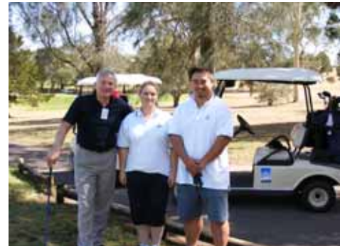
Gold Sponsor – QBE Australia Team