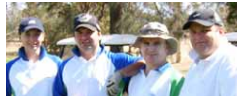
Silver Sponsor CGU Team