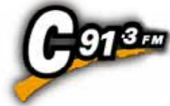
Supported by Macarthur Chronicle