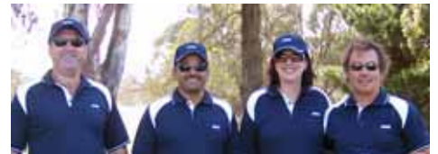
Silver Sponsor – AMP Team