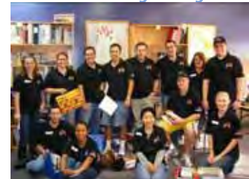
The Team from Lend Lease Group Delfin

Youth Solutions was lucky enough to be the recipient of a helping hand when Lend Lease Group Delfin held their annual Community Day at our office.